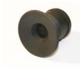
Shuttered Eyecup Ruggedized for covert operations