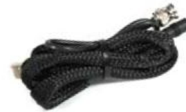
Computer Interface Cable Supplies Power and features BNC and USB connections