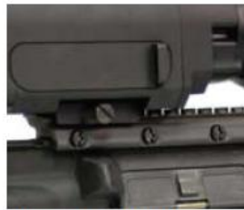
Weapon Base Mount Attaches to standard 1913 rail system