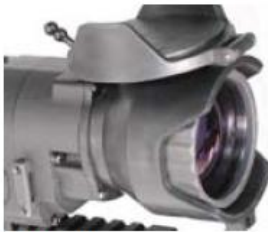
Lens Cover Injected molded urethane to withstand the rugged wear and tear of everyday usage