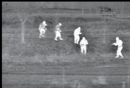
Suspicious activity in the woods