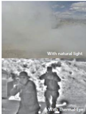
Soldiers seen through smoke